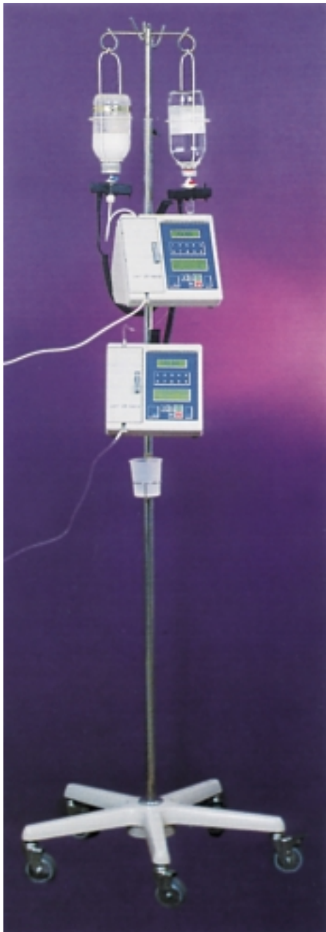
The infusion stand with two brakes.

The company MEDIPO – ZT develops, produces and sales a manufactures of medical devices. It means the technical equipment for infusion, lythotripts and endoscopes.